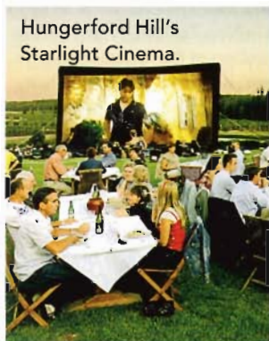
Hungerford Hill's Starlight Cinema.

Want to know what the weather is like at your next destination? Whether your flight's on time?